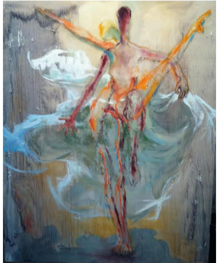
Yanique Norman, Portrait of a Slave Marriage , 2006, Graphite, Collage and Gouache on Paper